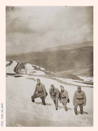
Unidentified photographer French soldiers' excursions to Baalbeck and the mountains, Circa 1928 Silver gelatin prints, 8.3×11.3 cm or 11.3×8.3 cm The Fouad Debbas Collection/Sursock Museum