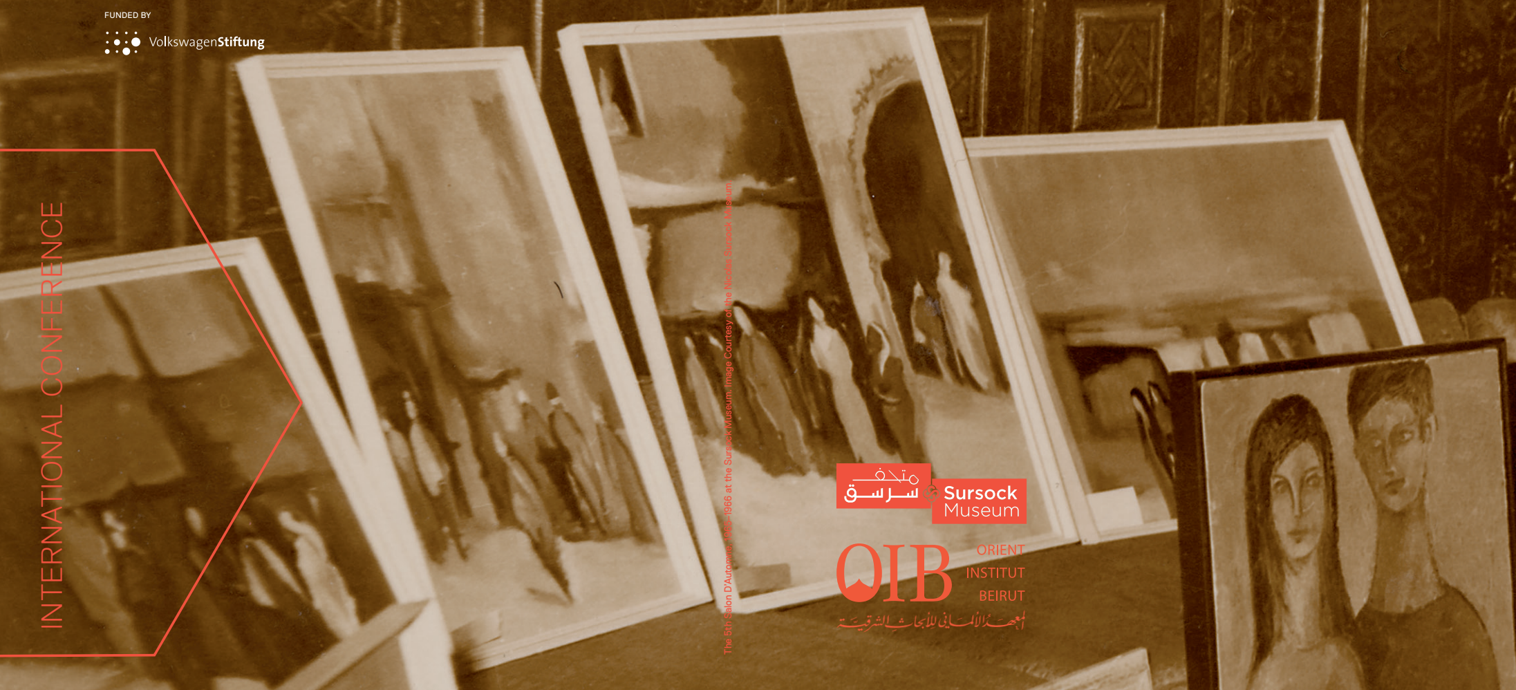
The 6th Salon D'Autonomie - 1966 - 1966 at the Sursock Museum.